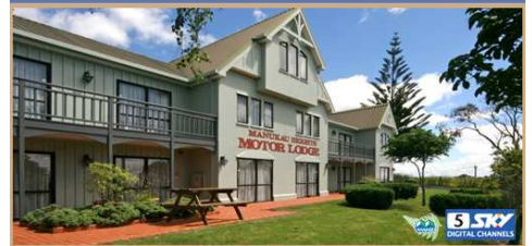
Manukau Heights Motor Lodge